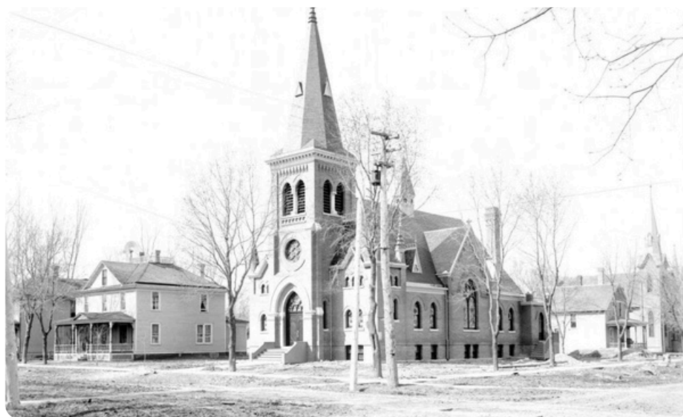
Bethesda Swedish Lutheran Church, Moorhead, Minnesota, 1906